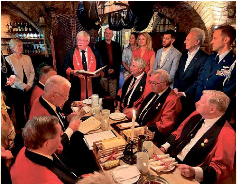
One of the merry initiations in 2022

Thirty-two members of the Crew and Officers from the Danish frigate Absalon were initiated on September 24th. Absalon is adapted by the City of Aalborg. It was a fine day, and the Chief Bencher remembered the first time the Crew were initiated in 2008 and handed over our C 4 crest.